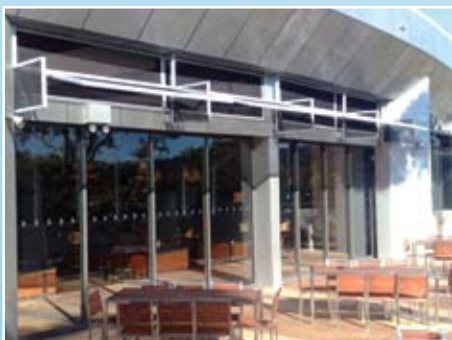
PITTWATER RSL (Doors Closed)