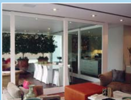
DARLING POINT PENTHOUSE (Doors Closed)