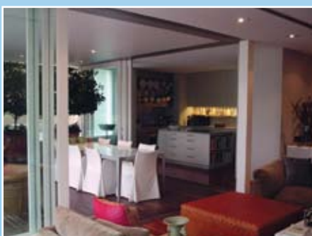
DARLING POINT PENTHOUSE (Doors Open)