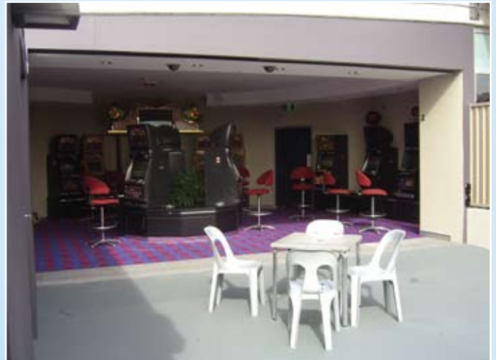
THE HANDLE BAR - SYDNEY OLYMPIC VELODROME (Doors Open)