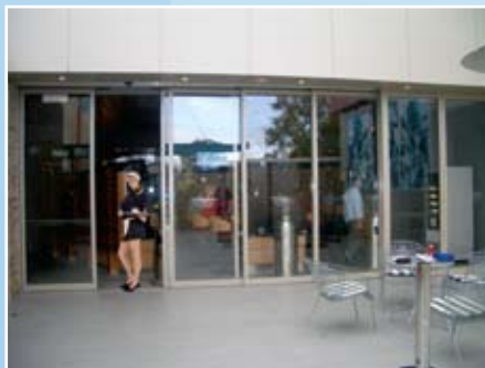
DUBBO RSL (Door in Auto Mode)