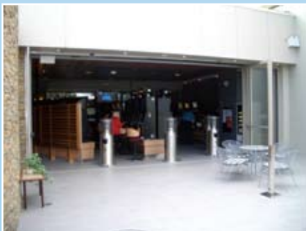
DUBBO RSL (Doors Stacked Open)

The Tracking system is designed for quiet and smooth operation making it completely noise free and it requires minimal maintenance. The ADIS unique bottom floor glide system is used at the floor level, that ensures for obstruction free movements across the doorway.