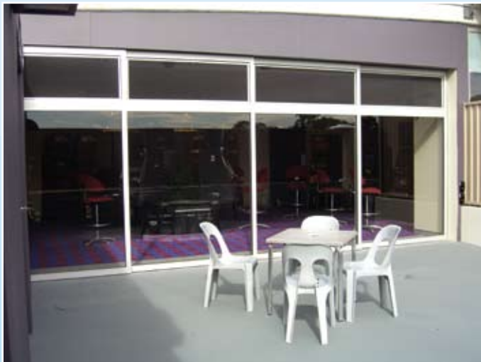
THE HANDLE BAR - SYDNEY OLYMPIC VELODROME (Doors Closed)

ADIS utilizes the latest technology in digital microprocessor technology giving the control unit multiple programmable modes including: provision to interface with building security & home automation systems and make operational adjustments as needed.