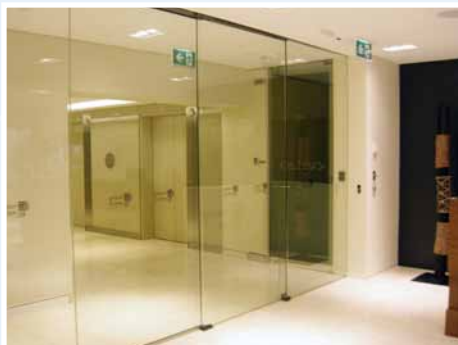
Frameless Telescopic Closed