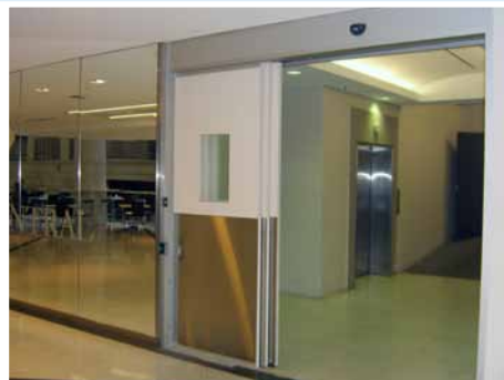
Frameless Glass doors in open position