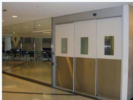
Framed Telescopic Closed