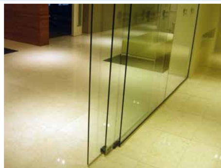
Frameless Glass doors in open position