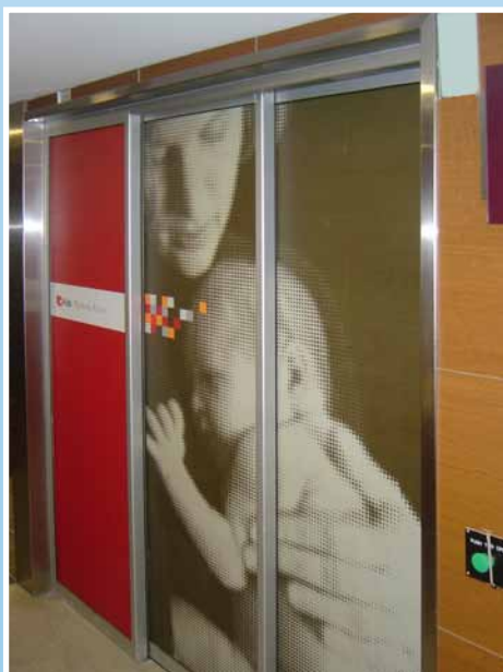
Confined doorway space