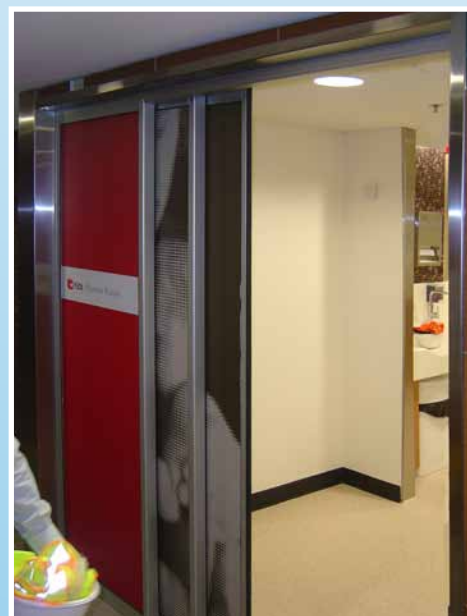
Maximum door opening using flush line glazing